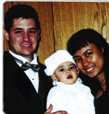
The Zemp Family