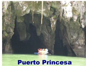
Puerto Princesa Underground River

seascape he had ever explored. Palawan has nearly 11,000 square kilometers (~4,250 square miles) of coral reefs with multitudes of marine life forms.