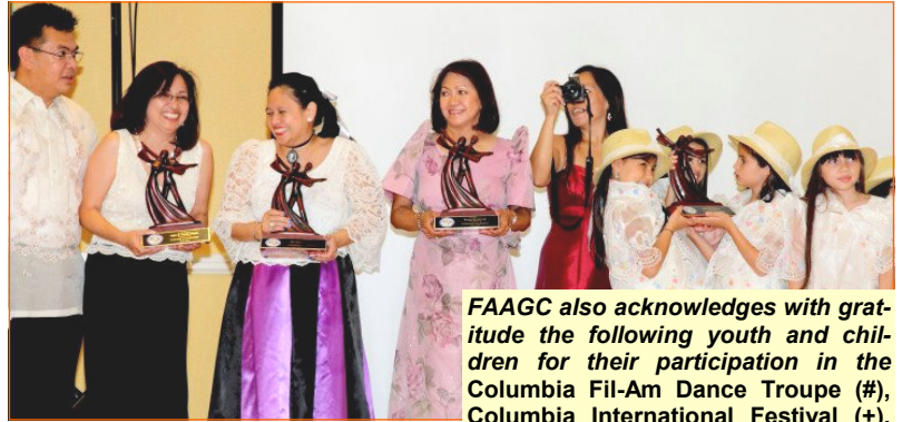
FAAGC also acknowledges with gratitude the following youth and children for their participation in the Columbia Fil-Am Dance Troupe (#), Columbia International Festival (+), or Christmas Party Presentation (*) :

The Filipino American Association of Greater Columbia proudly acknowledges with gratitude the following for volunteering time, talents, and services to the organization during the 2010-2011 term. The FAAGC certificates of appreciation were presented during the Columbia Fil-Am Summer Picnic and FAAGC Volunteer Appreciation Day held on June 26 at Ft. Jackson's Weston Lake Recreation Area.