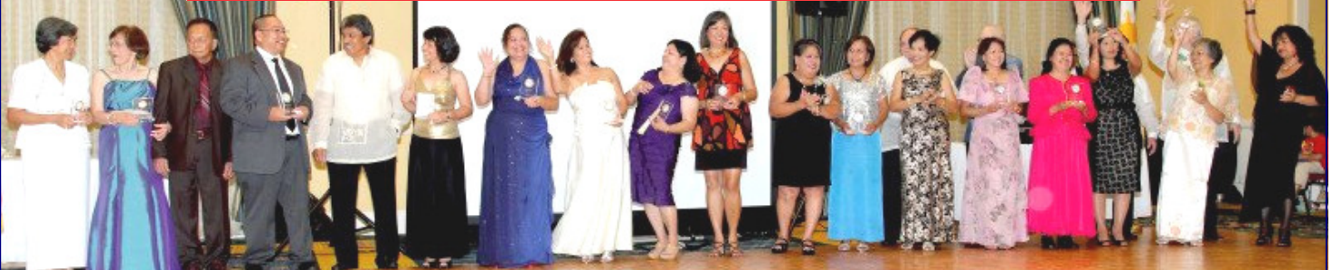
At the 20th Anniversary Gala held on September 10, 2011 at Columbia Marriott Hotel, the Filipino-American Association of Greater Columbia recognizes the Lifetime Sustaining Charter Members who have been continuous FAAGC members since 1991.