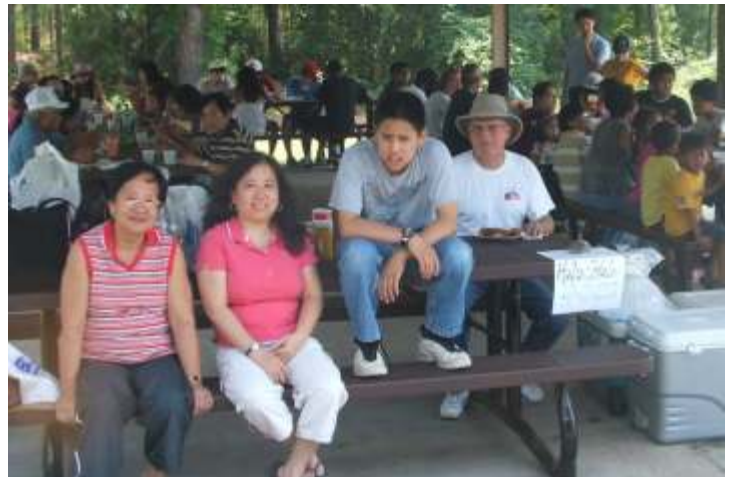
At the 2008 summer picnic at Weston Lake Recreation Area.