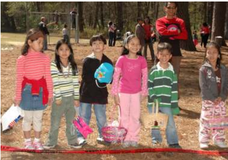
▲ Ready, get set . . . waiting for the GO signal for the traditional Easter egg-hunt at the 2008 Easter picnic at Sesquicentennial Park.