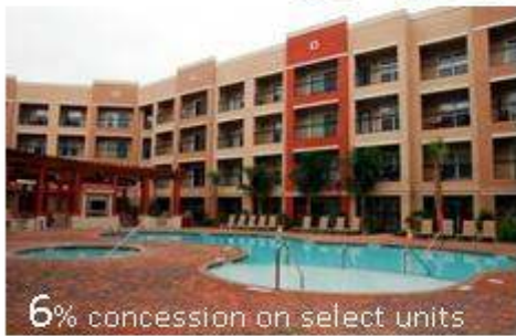
6% concession on select units