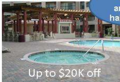
Up to $20K off