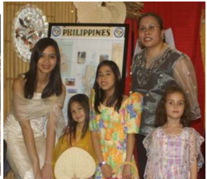
▲ At the 2008 Columbia International Festival.