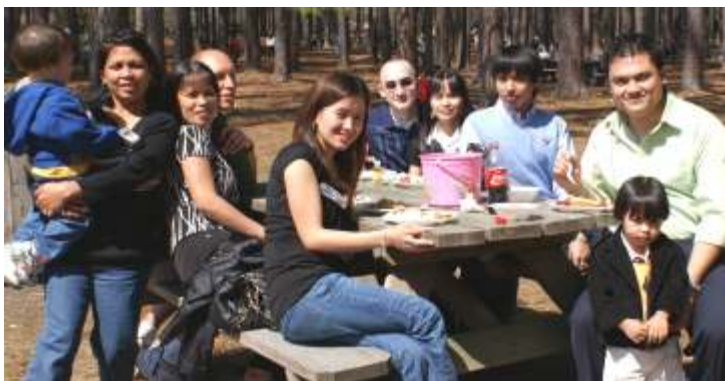
▲ At the 2008 Easter picnic at Sesquicentennial Park.